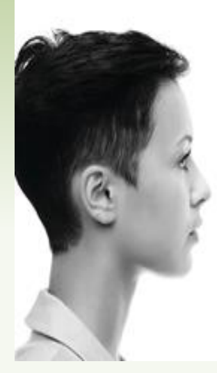
GO BACK TO WHERE YOU CAME FROM.